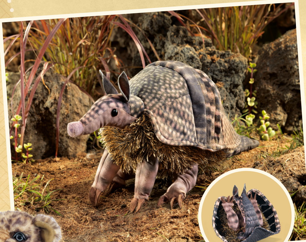
Armadillo 17" long 3207 Rolls and secures with magnets.