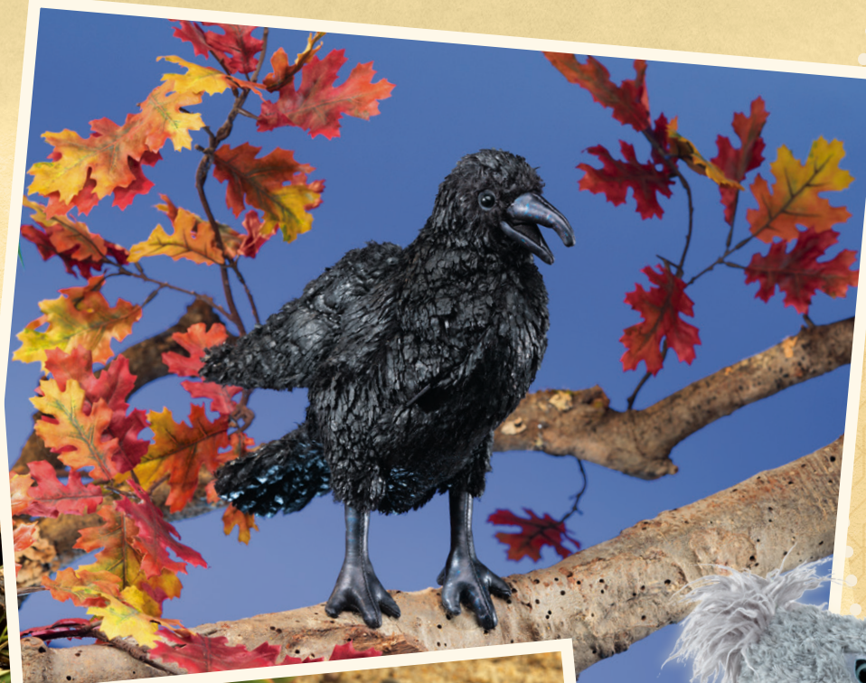
Crow 8" tall 3209 Does not stand alone as shown.