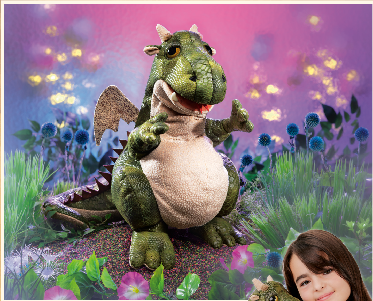
▲ Friendly Dragon 16" Tall 3211