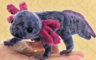
Black Axolotl 8.5" long 3208