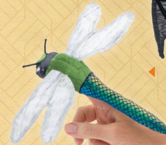
mini Dragonfly 7" long 8011